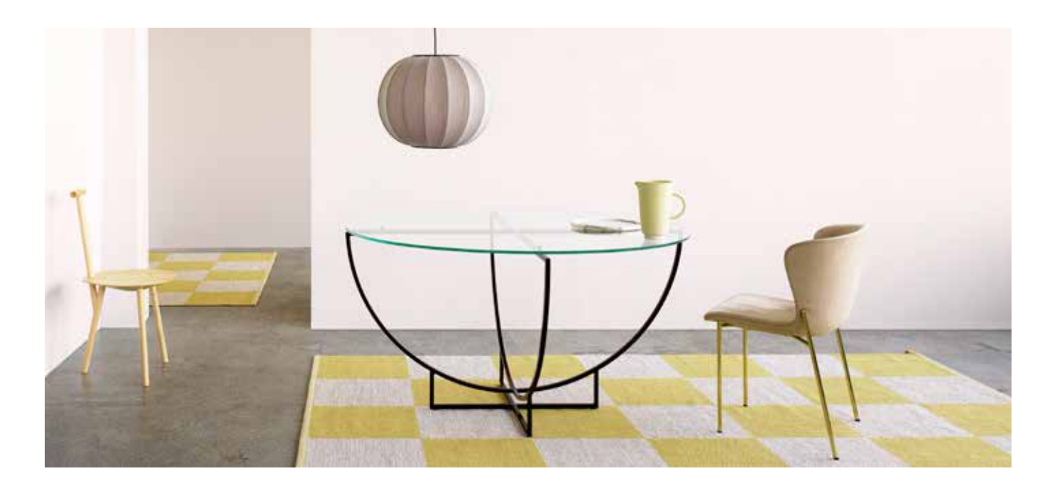
Arkad Checkerboard 920

Showrooms in MILAN | NEW YORK | STOCKHOLM | GOTHENBURG