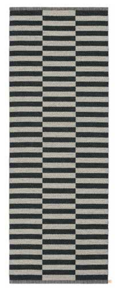
Arkad Standing Brick 938