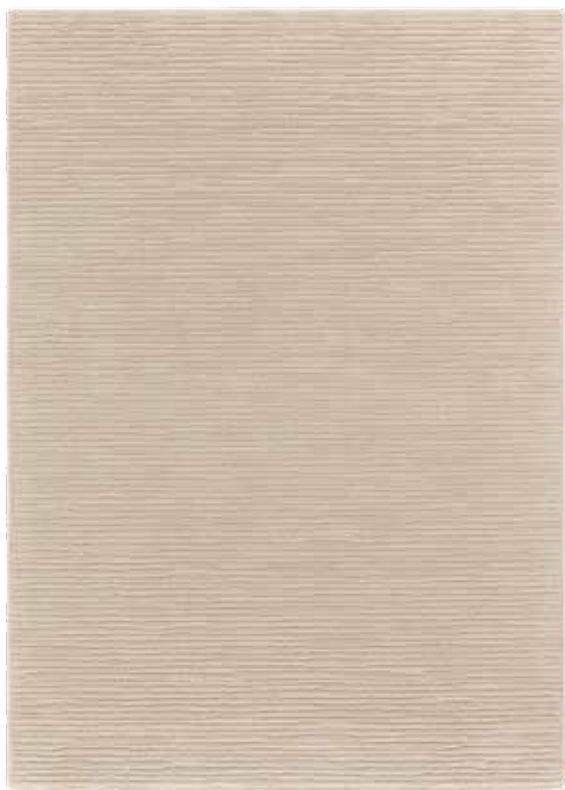
Rug Matrice Small 200x300 cm, Soft Ceramic 807