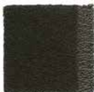
Dark Slate 514