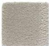
Silver Grey 512