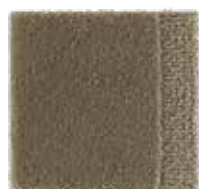
Botanic Shade 303