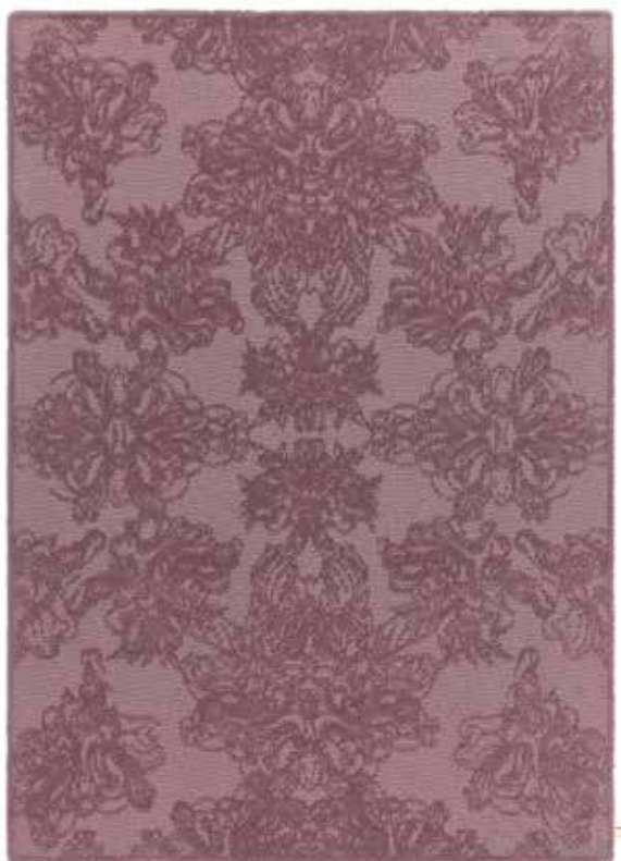
Rug Damask 170x240 cm, Rose Marble 611