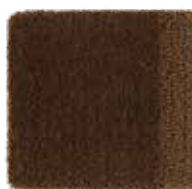
Antique Brass 706