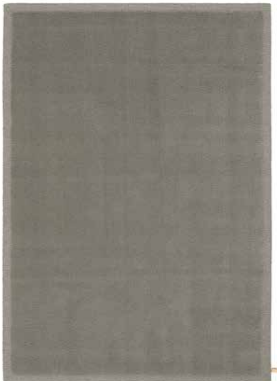
Rug Bouclé Border, 5 cm, 170x240 cm, Granite 5005

Design KASTHALL DESIGN STUDIO Hand tufted rug in high-quality wool