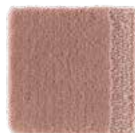
Rose Marble 611