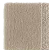
Soft Ceramic 807