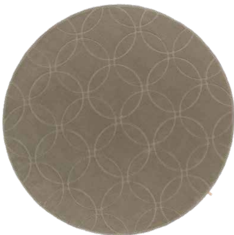
Rug Links Ø 240 cm, Botanic Shade 303