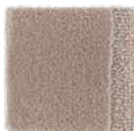
Hortensia Blush 620