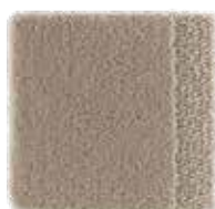
Misty Taupe 515