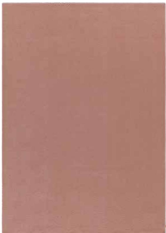
Rug Plain 170x240 cm, Rose Marble 611

Design KASTHALL DESIGN STUDIO Hand tufted rug in high-quality wool