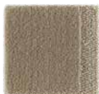
Satin Clay 806