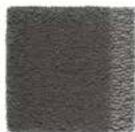
Elephant Grey 513