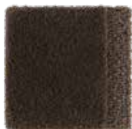
Mink Brown 707