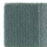
Muted Teal 203