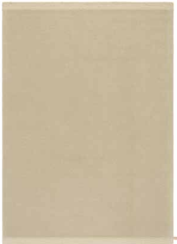
Rug Bouclé Border, 7 cm, 170x240 cm, Cream 8001