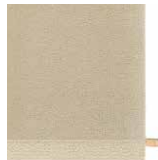
Bouclé Border (7 cm wide)