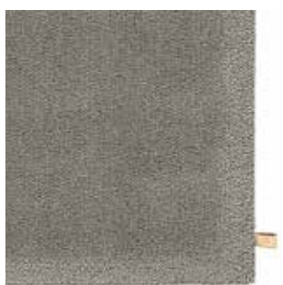
Bouclé Border (5 cm wide)