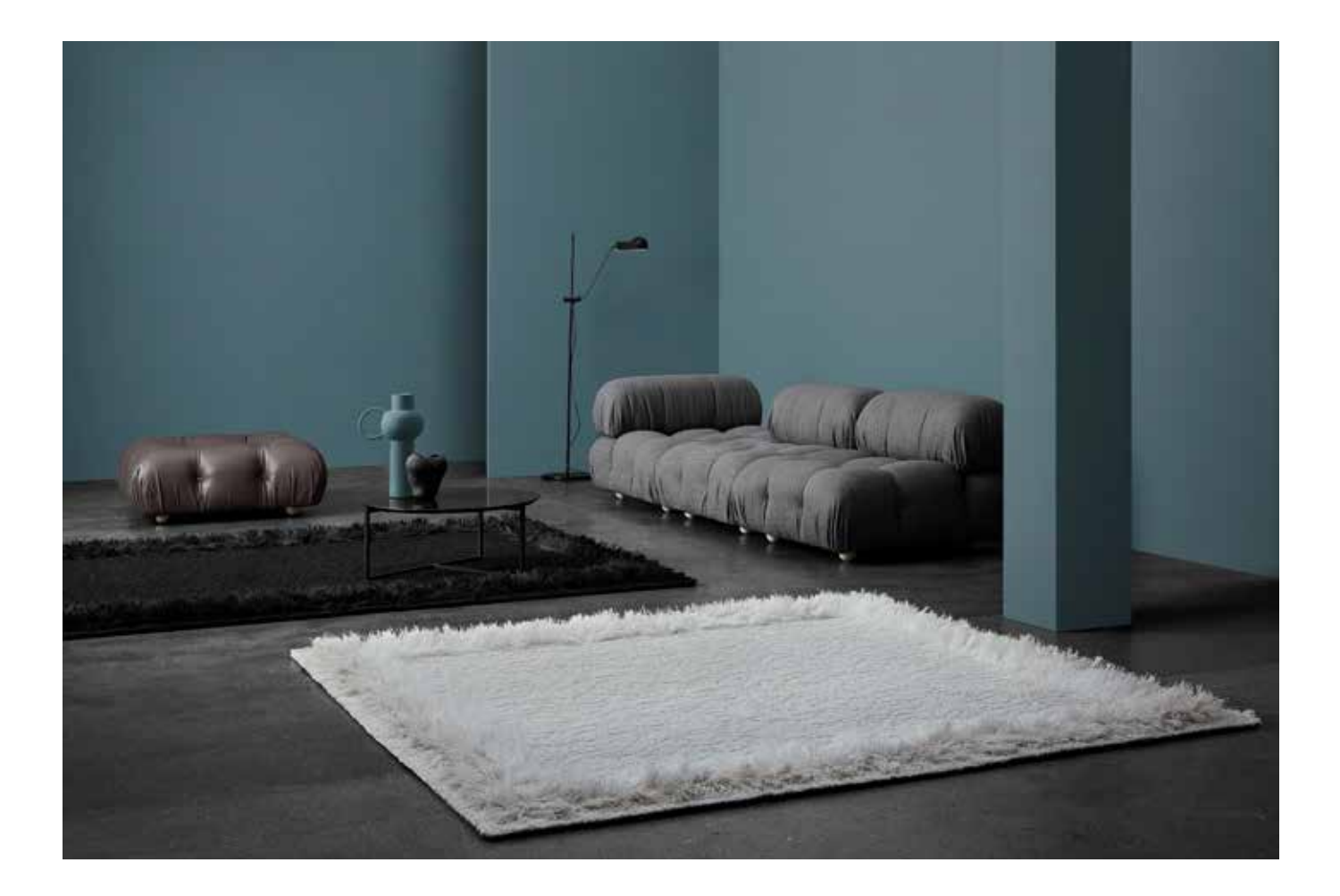
Rug 240x240 cm, Nandu 500

KASTHALL HQ SWEDEN Phone +46 320 20 59 00, Fax +46 320 20 59 01 Fritslavägen 42, Box 254, SE-511 23 Kinna, Sweden info@kasthall.se