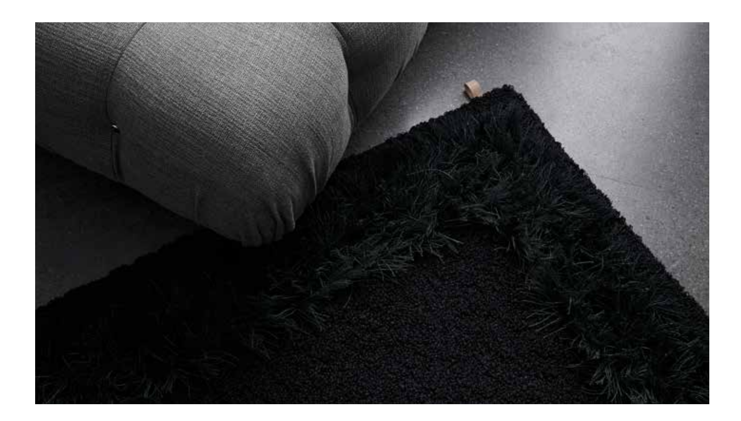
Rug 170x240 cm, Raven 502

KASTHALL HQ SWEDEN Phone +46 320 20 59 00, Fax +46 320 20 59 01 Fritslavägen 42, Box 254, SE-511 23 Kinna, Sweden info@kasthall.se