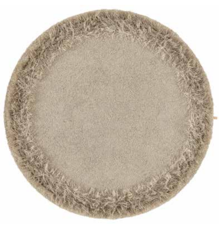
Rug round: Ø 240 cm, Heron 800