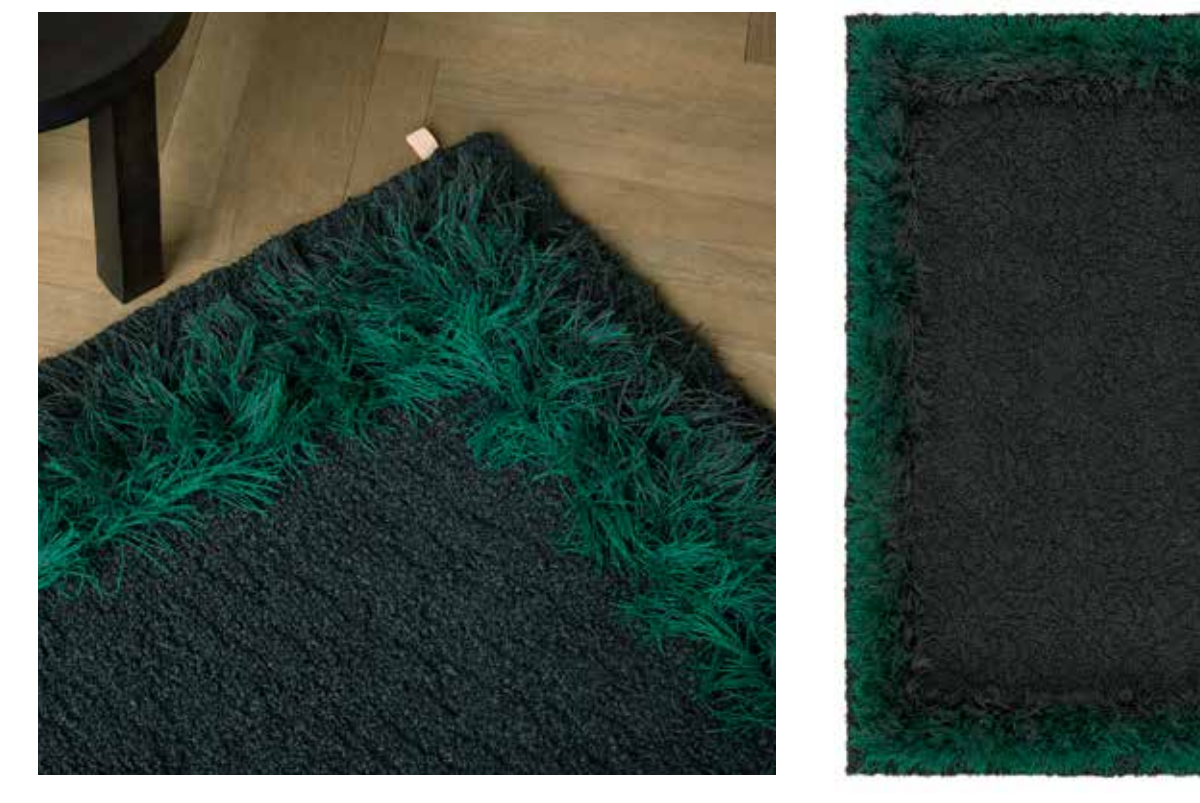
Rug 170x240 cm, Peacoock 501