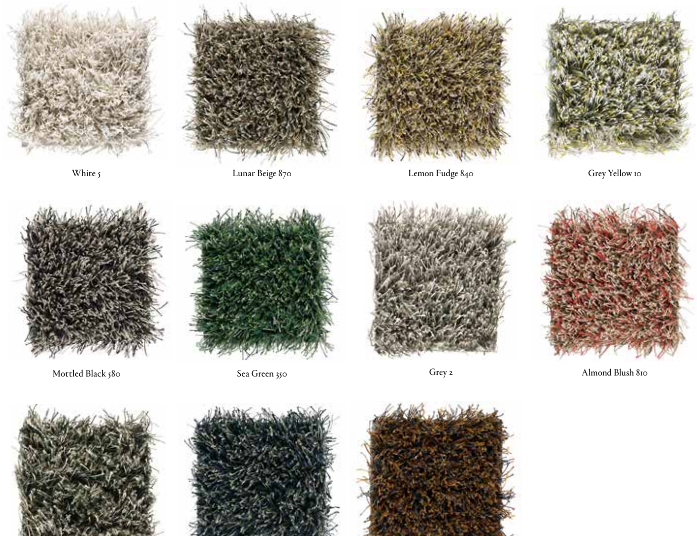
Dark Grey 1

Design GUNILLA LAGERHEM ULLBERG Hand tufted rug in pure linen FOGG