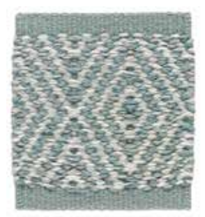
Misty Blue 250