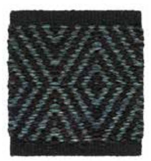
Denim Blue 220