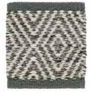
Stone Grey 580