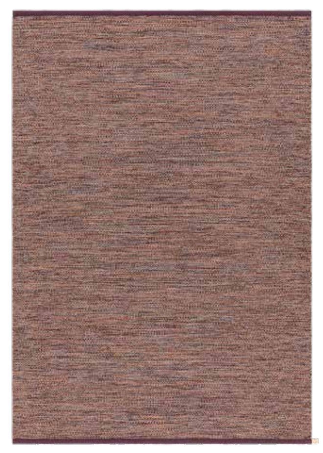
Rug 170x240 cm, Nippon Rose 600