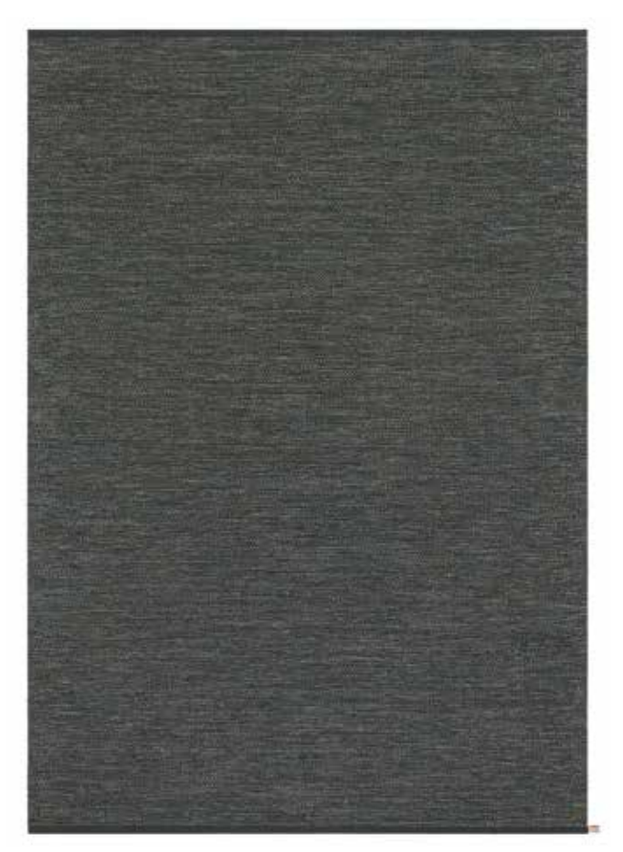
Rug 170x240 cm, Mountain Lake 202