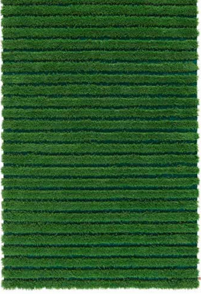
Rug 170 x 240 cm, Jungle 330

Phone +46 320 20 59 00, Fax +46 320 20 59 01 Fritslavägen 42, Box 254, SE-511 23 Kinna, Sweden info@kasthall.se