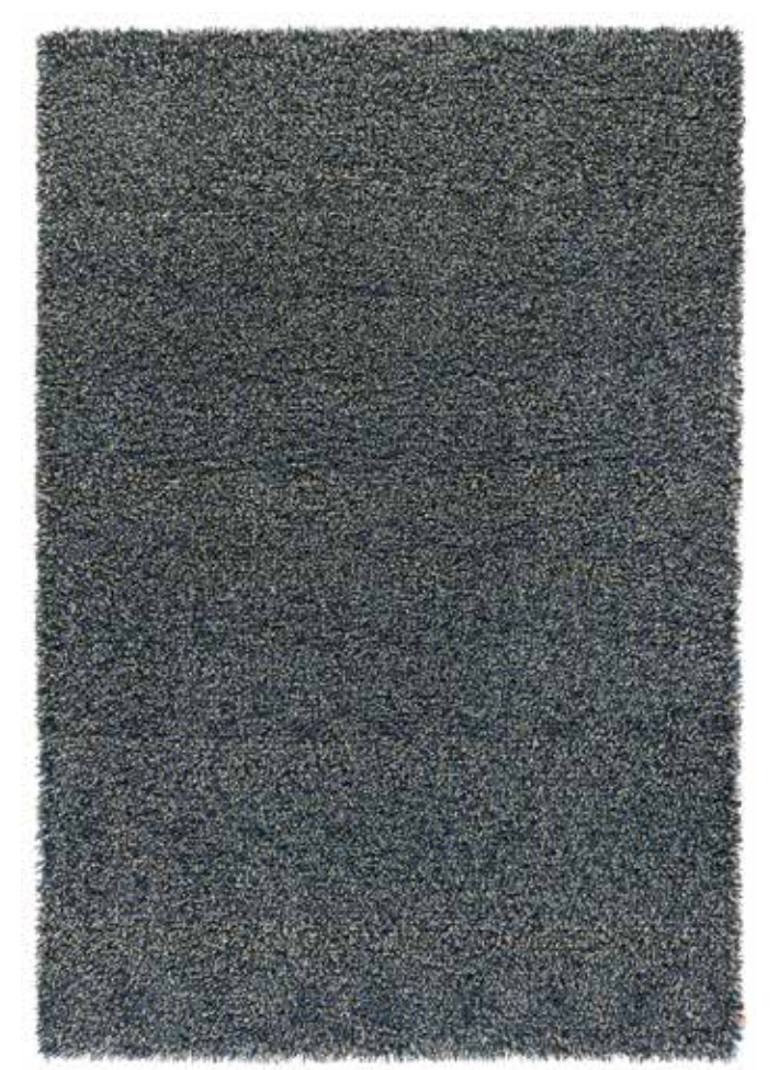
Rug 170 x 240 cm, Coconut Crisp 811